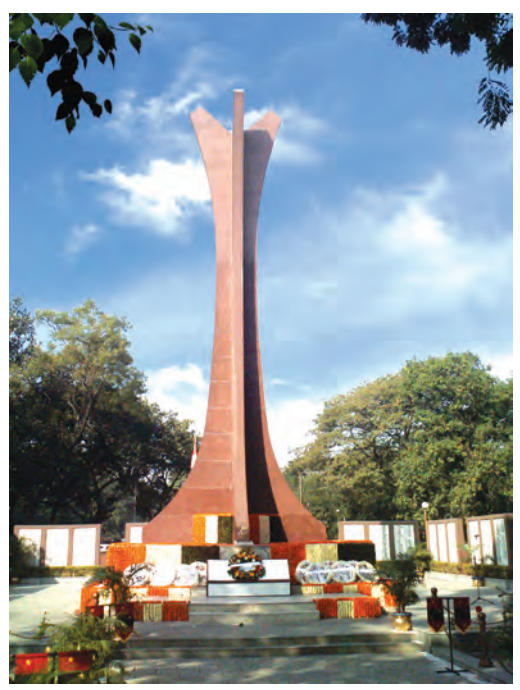
First World War - War Memorial at Pune

World War I left significant impact on various fields including production of war supplies, civil industries, trade, economic policies, sea and land transportation, farming and agricultural production, fuel supply, defence systems, etc. This war boosted India's industrial growth. The direct and indirect impacts of the war were more evident in fields like iron industry, steel industry, coal and mining industries. After the war was over, there was considerable growth in motor transportation and the number of motor vehicles. During war times and post-war period there was decrease in the export amounting to a loss of Rs.33 approximately. The prices crores, agricultural products reduced but the prices of industrial products increased. Indian food grains were exported to England and allied nations. It caused a shortage of food grains for the Indians. Prices of food grains in Indian markets began to rise.